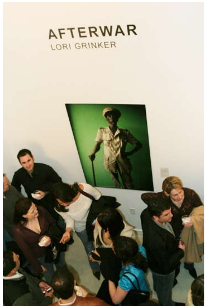
Project 4 Washington DC February 2006