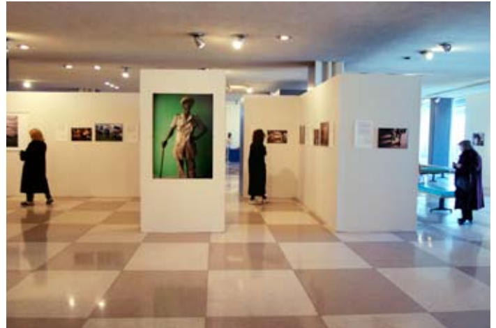
United Nations Headquarters - Visitors' Lobby New York City, New York January 24 - February 28, 2005