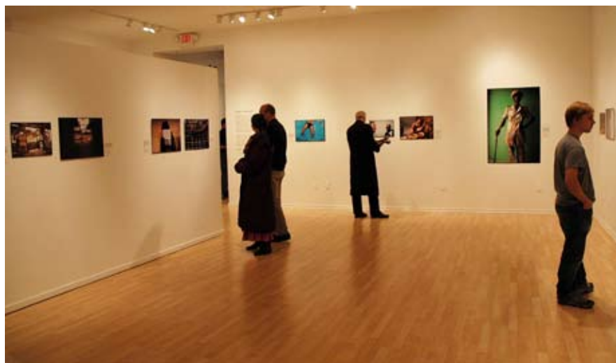
Minnesota Center of Photography Minneapolis, Minnesota November 4, 2006 – January 7, 2007