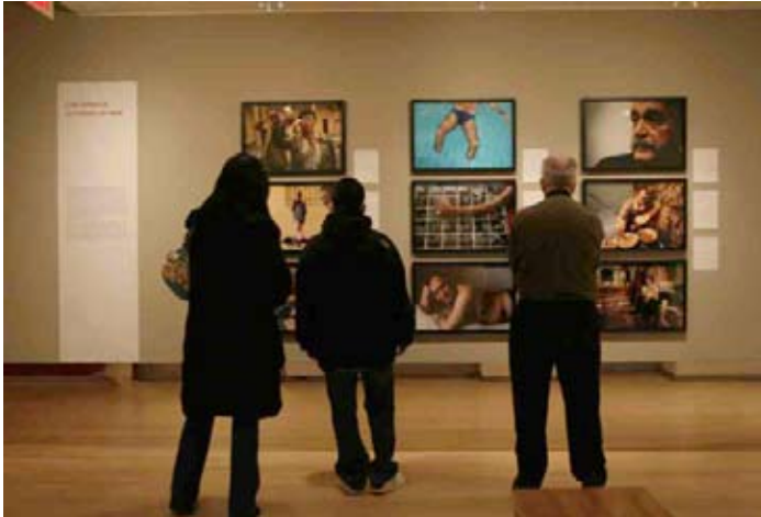
"The Body at Risk," International Center of Photography, New York City, New York December 9, 2005 - February 25, 2006