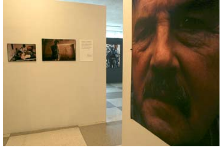
United Nations Headquarters - Visitors' Lobby New York City, New York January 24 - February 28, 2005