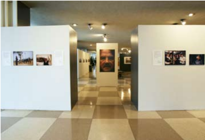
United Nations Headquarters - Visitors' Lobby New York City, New York January 24 - February 28, 2005