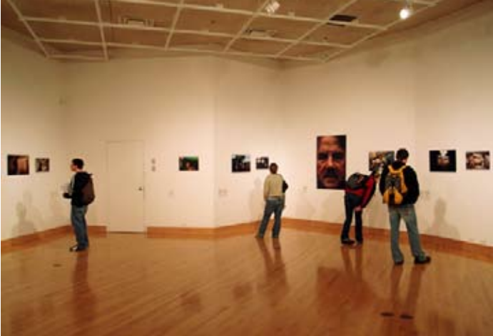
Indiana State University University Art Gallery September 27 – October 20, 2006